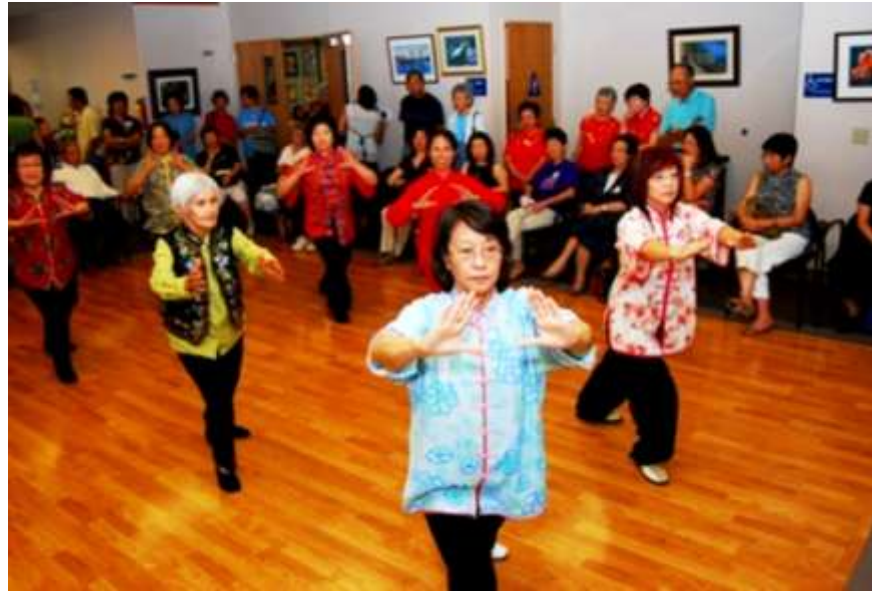
Asian Community Center Program Participants