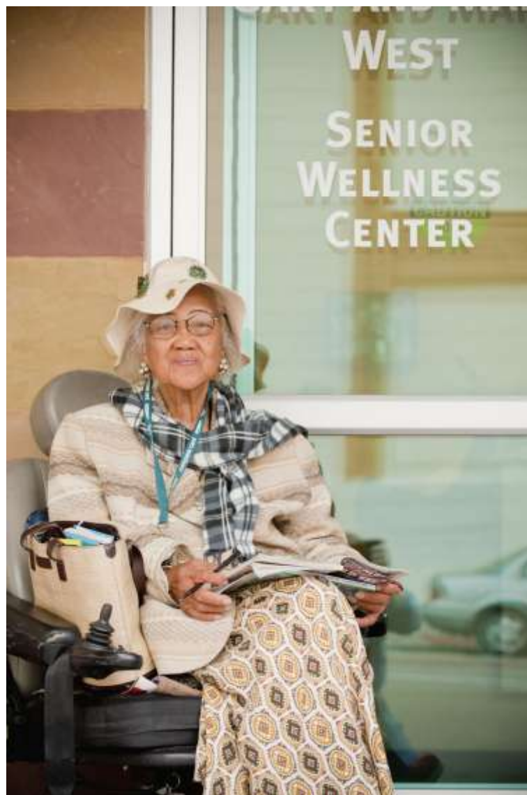
California Commission on Aging