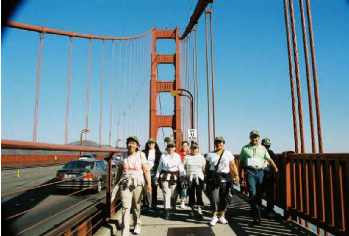
Participants from Centro Latino de San Francisco Community Center crossing the Golden Gate