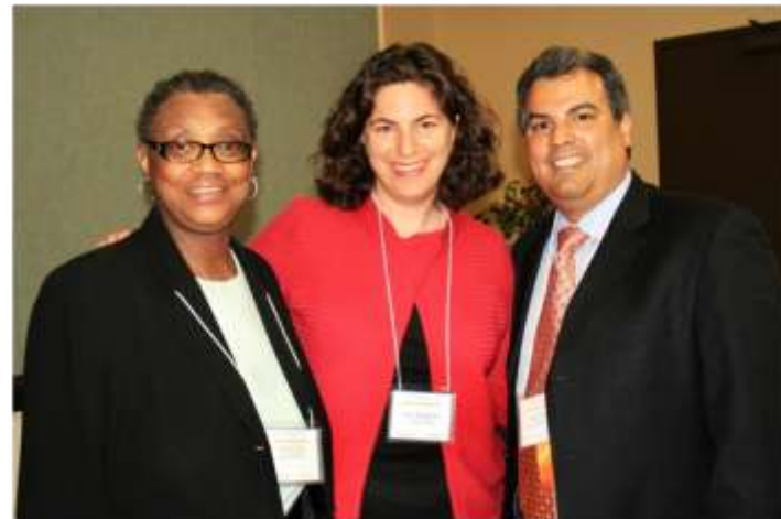
LAAAC Advocacy Event