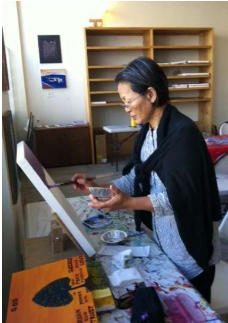
California Commission on Aging