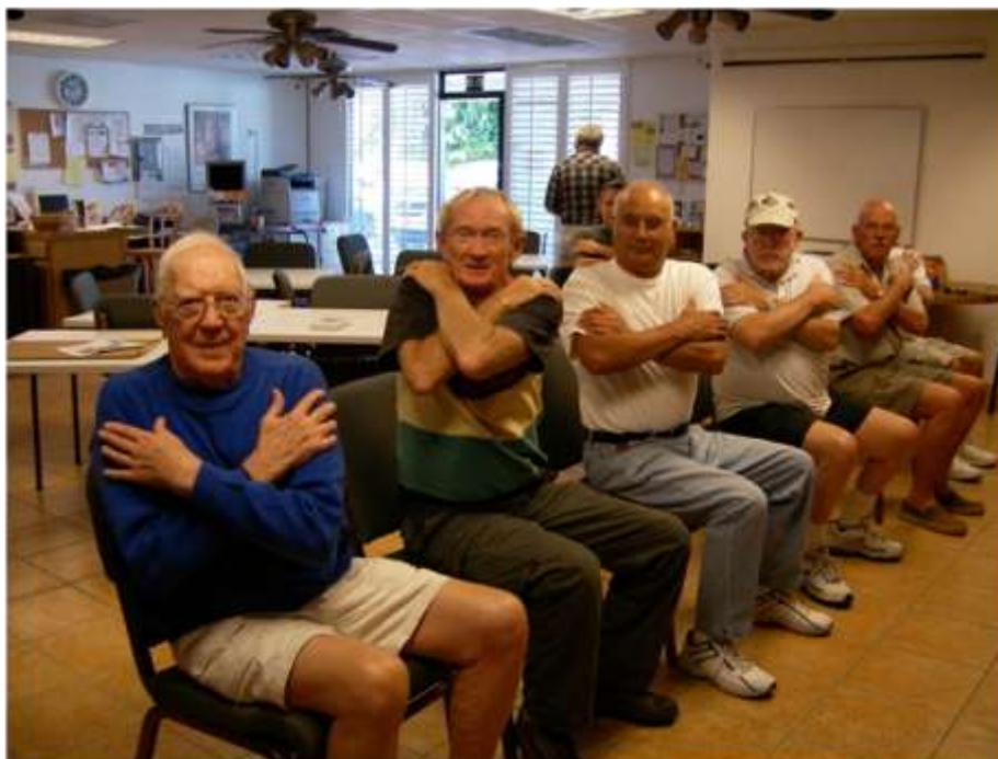
Chair Yoga is part of LGBT Center of the Desert's programming.