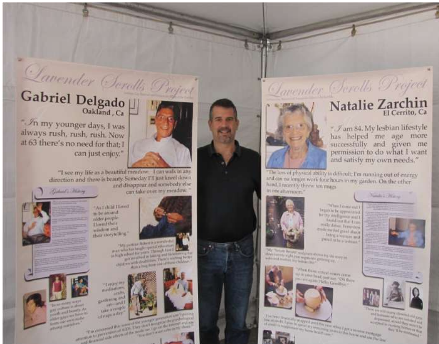
The Lavender Scrolls Project honors program participants by decorating dining hall walls with celebrations of participants' life histories.