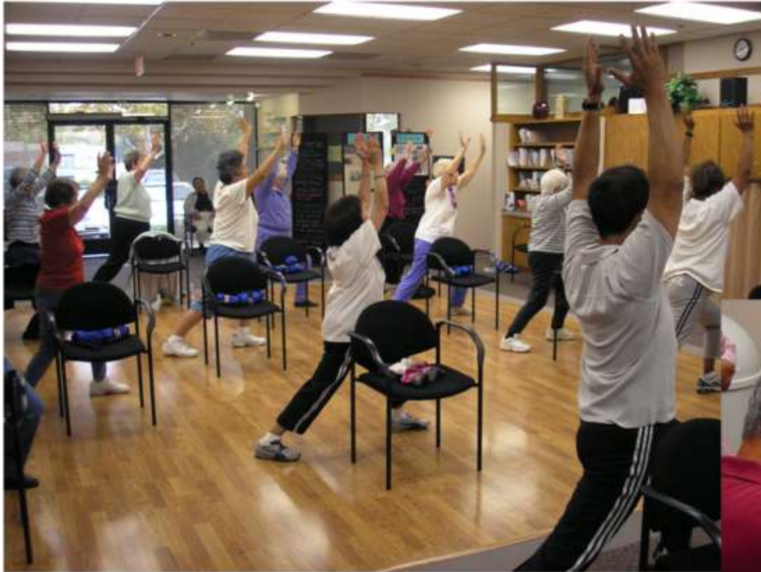
ACC participants enjoy a range of activities