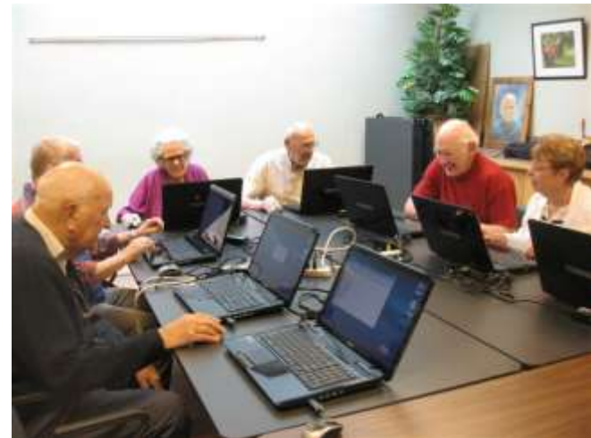
Participants of the Healdsburg Senior Center try out new laptop computers purchased by the Friends of the Healdsburg Senior Center.